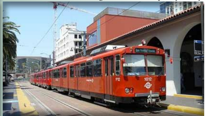
SDMTS Trolley at the downtown Sante Fe Depot

Other popular sites include Sea World, San Diego Zoo and Wild Animal Park, Old Town San Diego, Gaslamp Quarter downtown, Balboa Park, Legoland, Coronado Island and beaches. Disneyland, Knott's Berry Farm, Universal Studios and Las Vegas are within short flight and driving distance