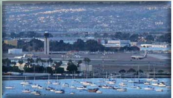
San Diego International Airport by the bay

Delta and Continental Airlines provides Live Animal Cargo into San Diego as separate freight. It is less expensive to fly your pigeons air cargo and SDMPCC will arrange to pick up/return your birds at no cost during the allotted dates/times. If you travel with your birds, we will provide the same shuttle service if you stay at the T&C. Both airlines no longer require a health certificate; Delta changed its policy to include pigeons and only requires the owner to take the liability.